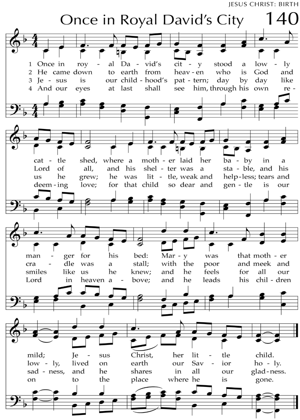
Like "All Things Bright and Beautiful" (see no. 20), this popular Christmas hymn was written by an Irish poet to illustrate for children the various articles of the Apostles' Creed. It is not known which of several English villages the composer had in mind when naming this tune.